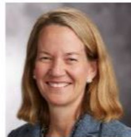
Kris Mayes Candidate, State Attorney General

Click HERE for Zoom link. Link will be active 10 minutes before meeting begins.